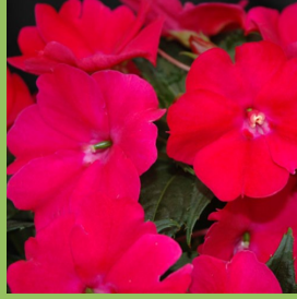
Compact Royal Magenta