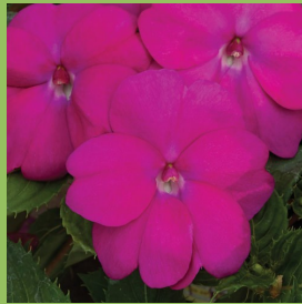
Compact Neon Pink