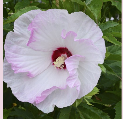
Summerific 'Ballet Slippers'