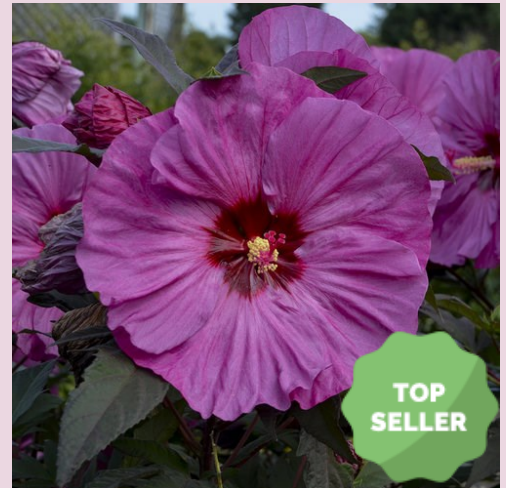
Summerific 'Berry Awesome'