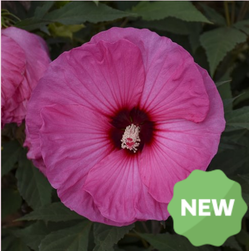
Summerific 'Candy Crush'