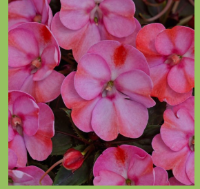
Compact Pink Candy