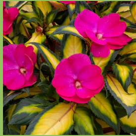
Compact Tropical Rose