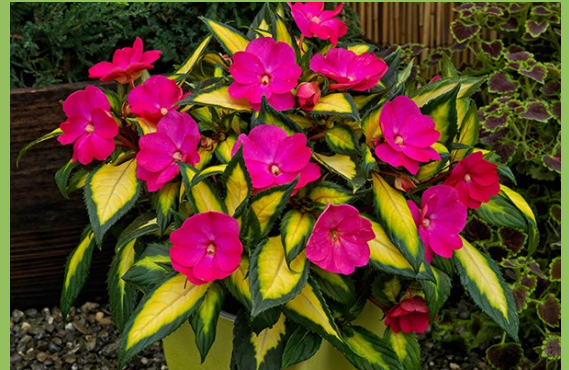
Compact Tropical Rose