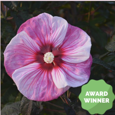
Summerific 'Cherry Choco Latte'