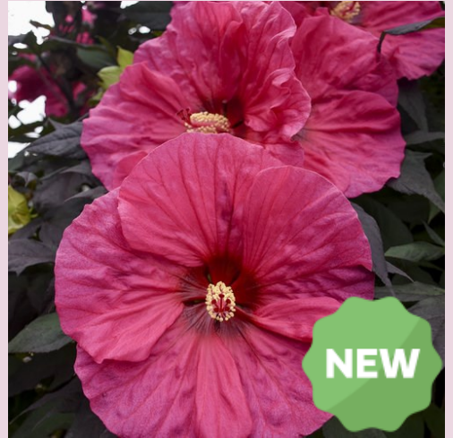
Summerific 'Evening Rose'