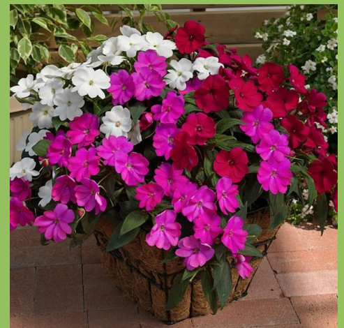
Compact Purple, Fire Red, & White