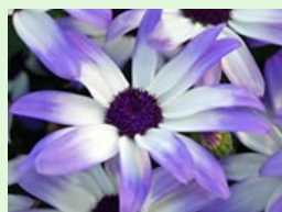
Light Blue Bicolor

Patio Containers, Outdoor Bedding, Indoor Plant