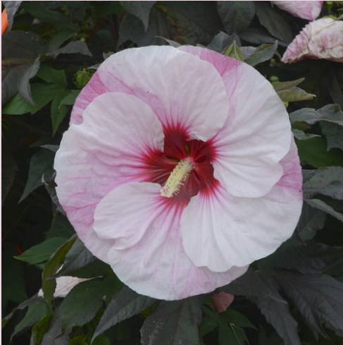
Summerific 'Perfect Storm'