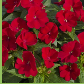
Compact Fire Red