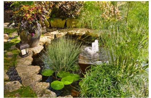
Juncus Blue Mohawk in pond