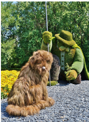
Carex Toffee Twist Sheepdog Topiary