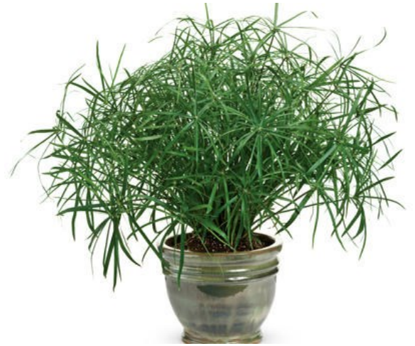
Cyperus-'Baby Tut' (Umbrella Grass) ☀️