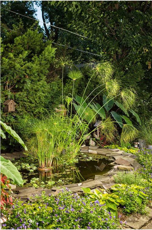
Cyperus King Tut & Prince Tut