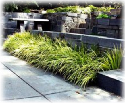
Acorus Ogon border

Acorus Golden Variegated Sweet Flag is a grass like perennial with butter-yellow sword-like blades. It's a great addition to containers, the border, or the edge of a garden pool or pond, as it likes moist soil.