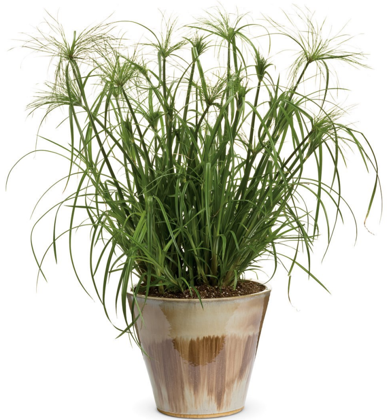
Cyperus 'King Tut' (Egyptian Papyrus) ☀️ Z 9-10 / Ht 48-72"

Cyperus King Tut Euphorbia Diamond Frost Ipomea Illusion Emerald Lace