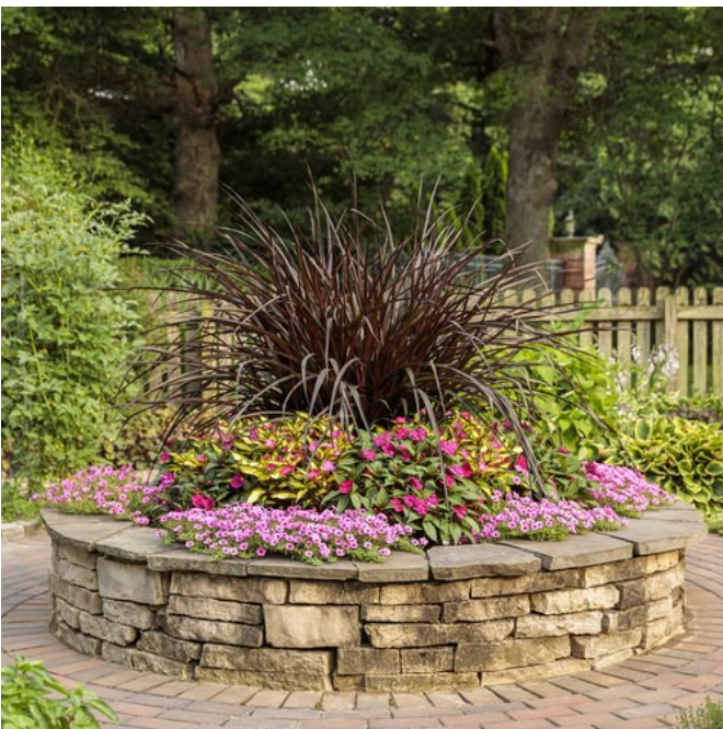
'Vertigo' focal point thriller

With rich burgundy foliage, this fast and easy warm season grass reaches 3-6' tall depending on the location and season. A bit too big for a 4.5", but impressive in all container sizes.