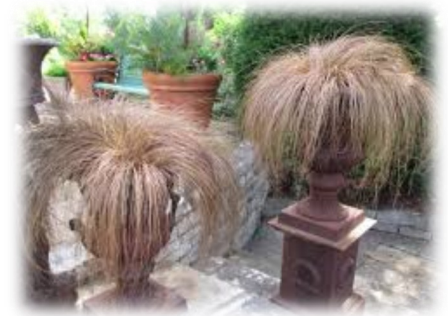
Carex Toffee Twist formal planters

Iridescent, slender mahogany foliage drapes gracefully and is especially attractive as an accent plant.