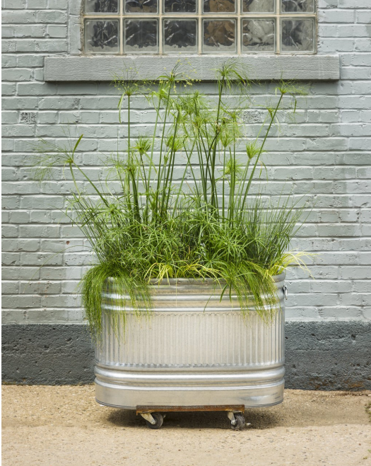
Urban Container Cyperus Baby Tut Cyperus King Tut Juncus Blue Mohawk Scirpus Fiber Optic