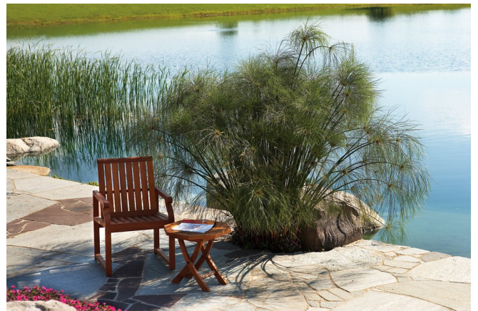
Cyperus King Tut