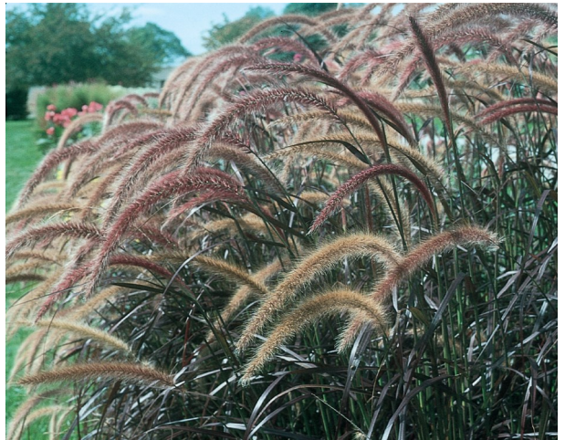
Purple Fountain Grass

Waves of Graceful nodding, soft purple plumes arch up and out from burgundy-tinted foliage in true fountain grass form. Especially dramatic in groups, mass plantings, and as a single focal point.