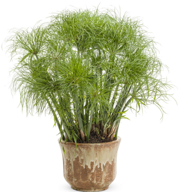
Cyperus-'Prince Tut' (Egyptian Papyrus) ☀️